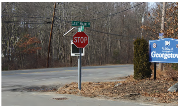
Georgetown Welcome Sign